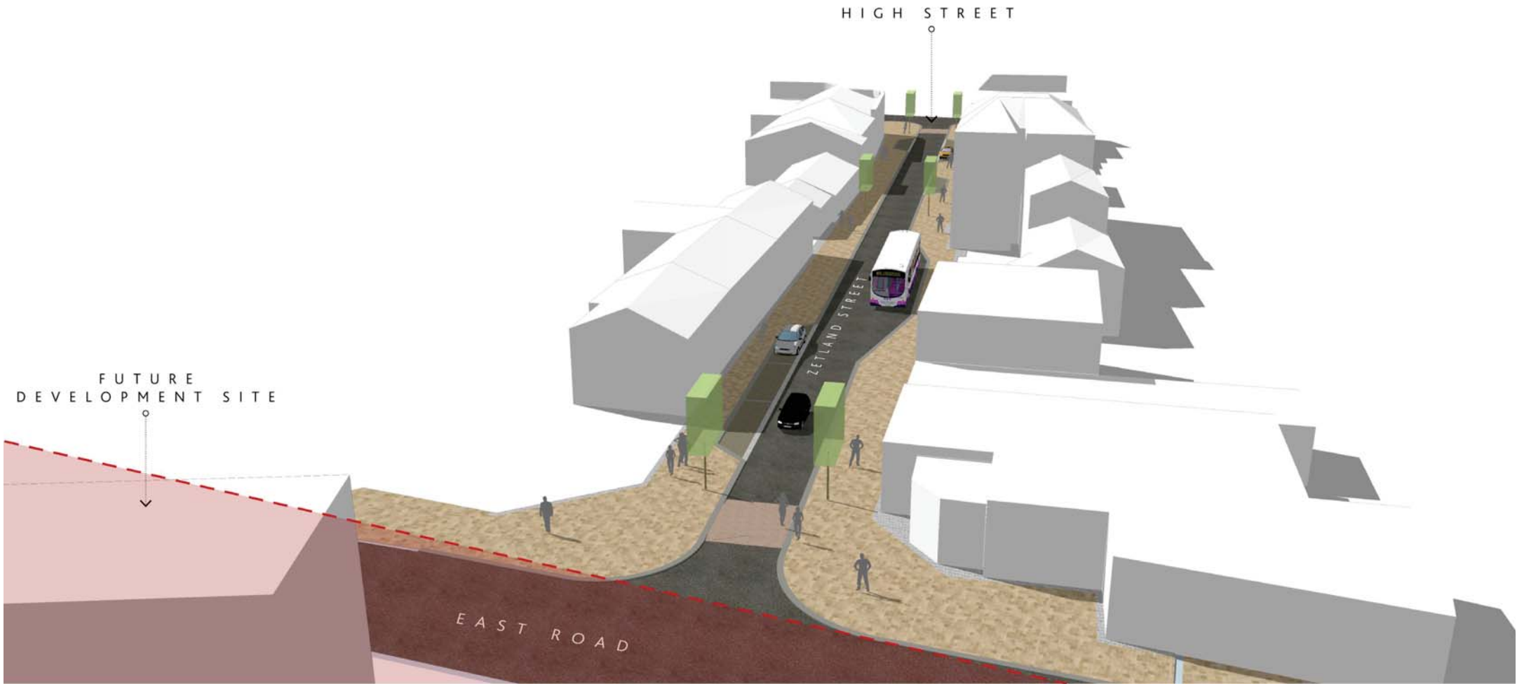
View from the Prison Site down Zetland Street towards High Street