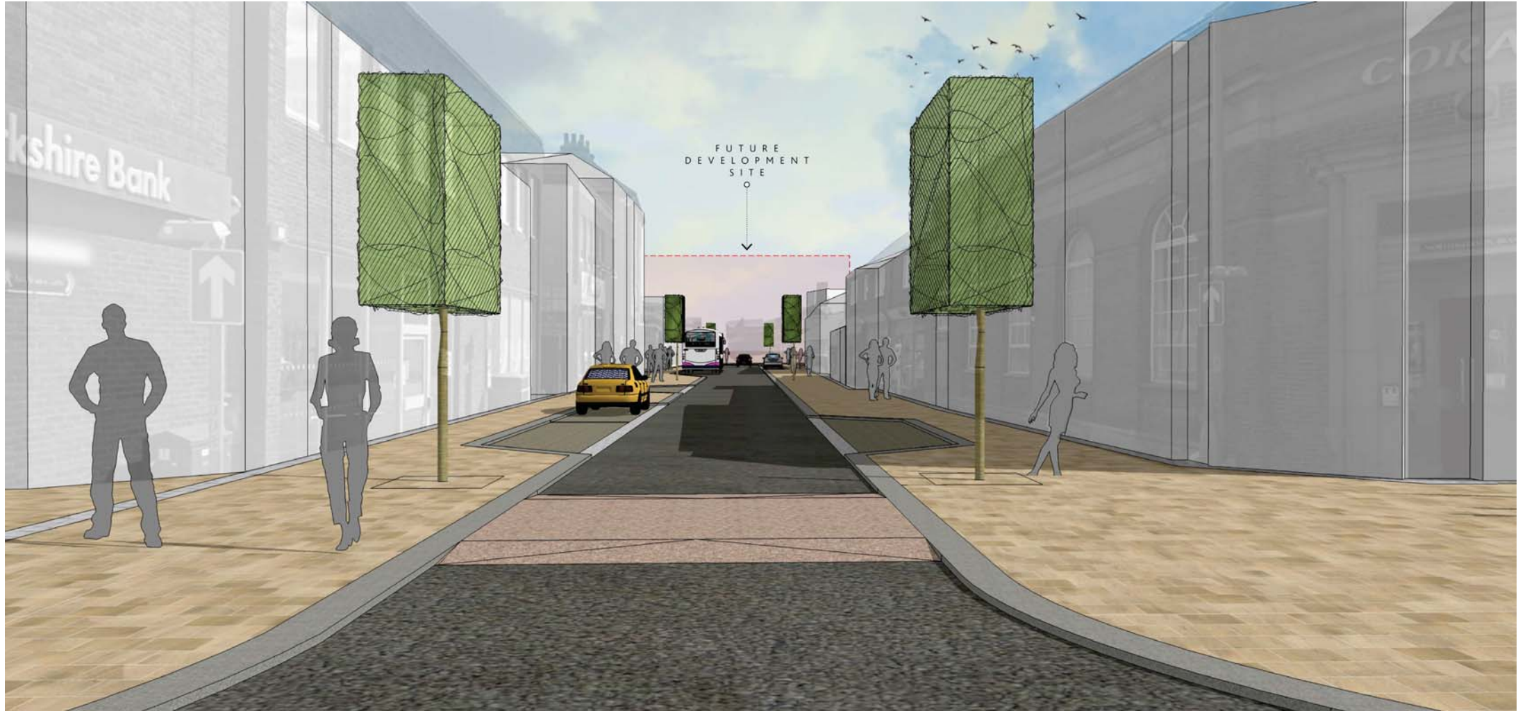
View of Zetland Street from High Street towards the Prison Site